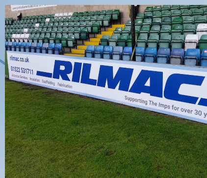
The new Rilmac board behind the goal at Sincil Bank

Viewers of the recent television highlights of Lincoln City's progress in the FA Cup will have been able to glimpse a sign of long term support for The Imps from the Rilmac Group. Rilmac have been supporting Lincoln City, in one form or another, for over three decades now. This has included, for many years, a pitch side board, behind the goal, at the IMPS stand of Sincil Bank. Recently a new board has been designed and installed, replacing the previous which was getting a little tatty. The new version arrived just in time for the BBC cameras as Lincoln City beat Altrincham in the first round of the FA Cup. Subsequently we have been proud to see it supporting The Imps in matches against Oldham, Ipswich and Brighton.