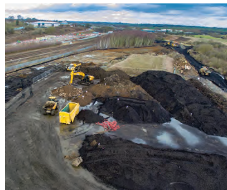
Land remediation for housing development

Rilmac can assist through the different stages of the project, from investigation and discovery, through to removing and disposal. Our team are capable of managing any project, from domestic to large commercial or industrial. All projects are completed while maintaining full compliance and a meticulous attention to detail.