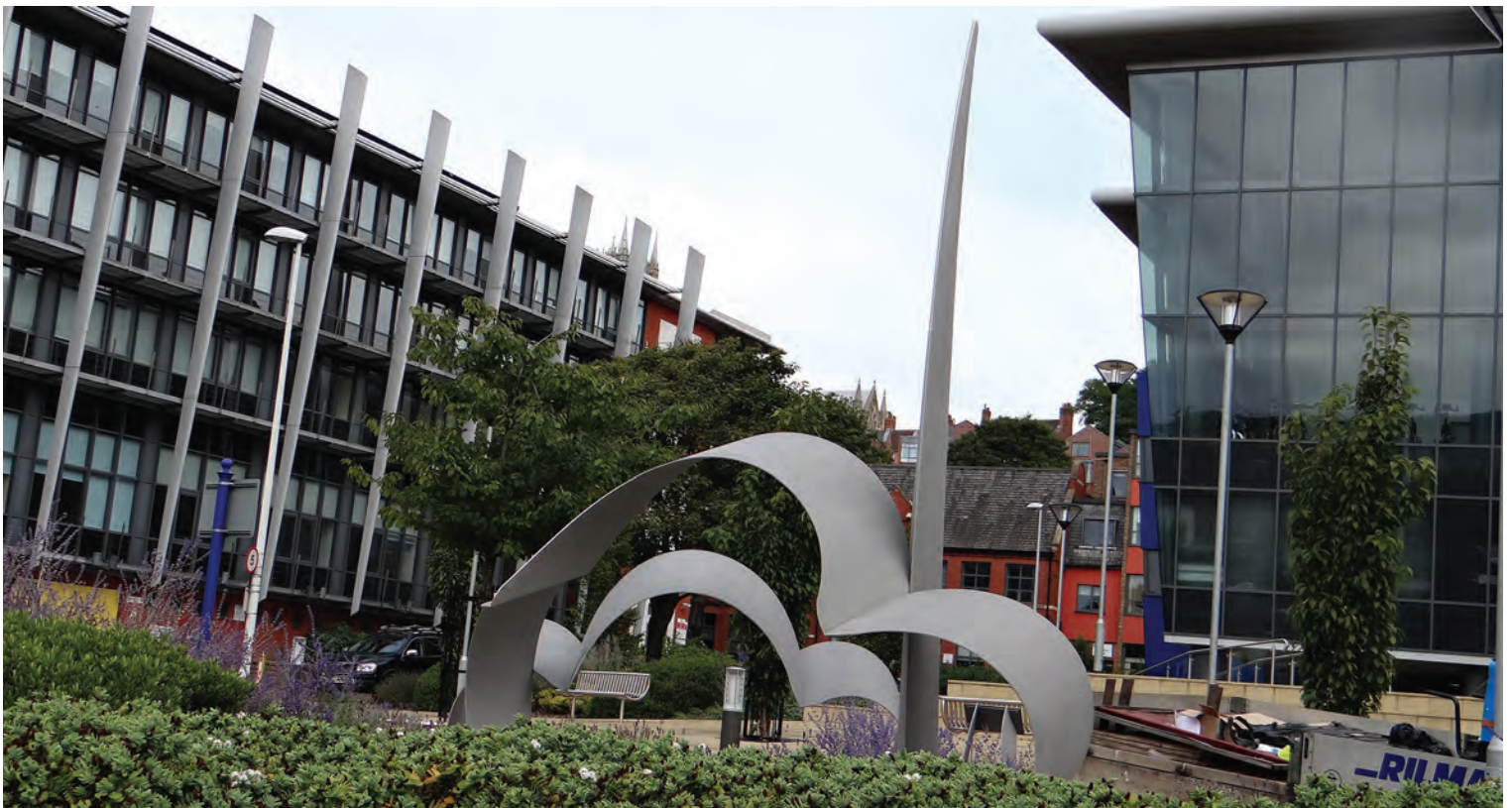
Steel memorial sculpture for RAF Squadron Leader at Lincoln College