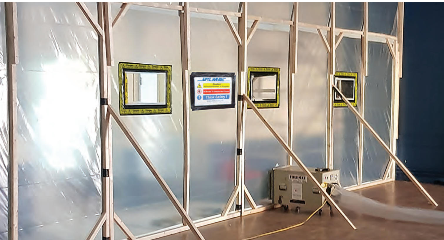
Enclosure for asbestos removal at a school