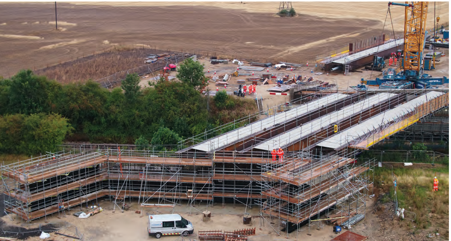
Scaffolding to abutments for bypass bridge across rail line