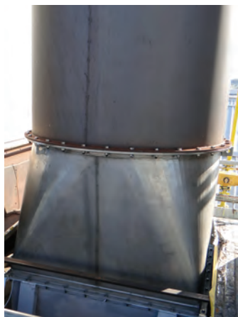
Ducting for Siemens

We have successfully completed projects with a range of welded materials from 0.2mm up to 400mm thick and provided finished products to off shore painting requirements such as C5M and NORSOK.