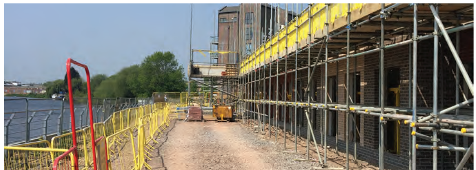
Access scaffolding for housing development in Nottingham

A longstanding NASC member, Rilmac Scaffolding have achieved ISO 9001, 18001 and Achilles Accreditations. Rilmac are proud to be one of the first scaffolding companies to have achieved ISO 18001 in the UK.